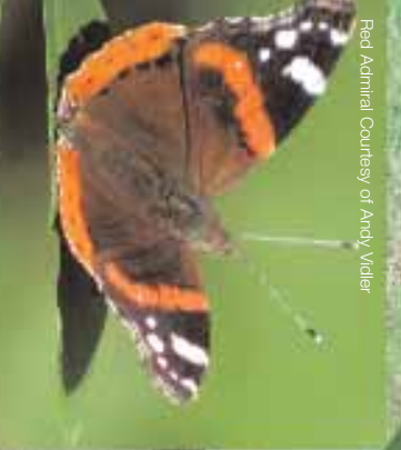
Red Admiral