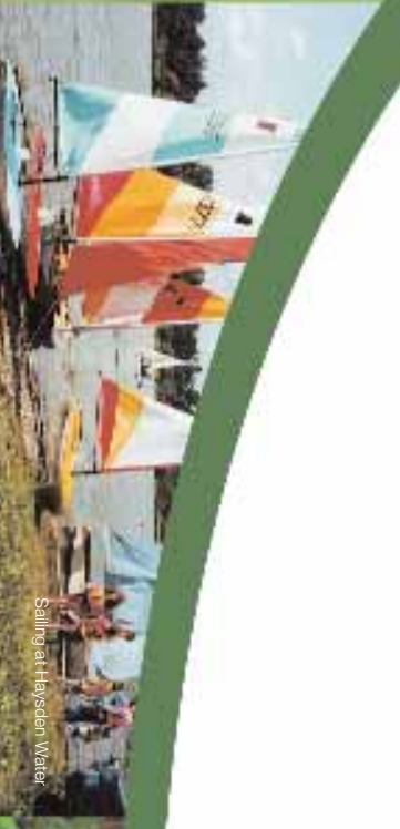
Sailing at Haysden Water