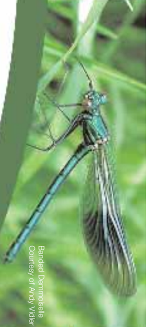
Banded Damselfly