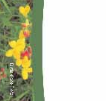
Elfin's Foot - Trefoil