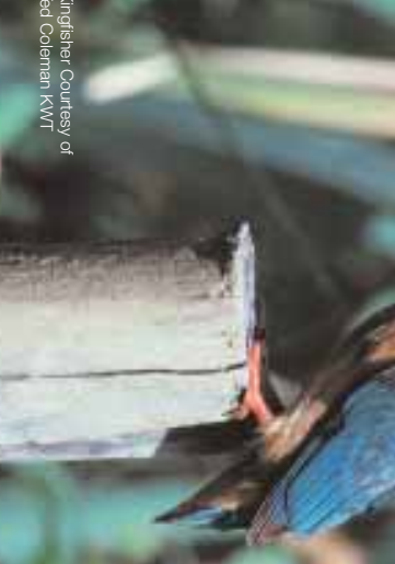
Kingfisher